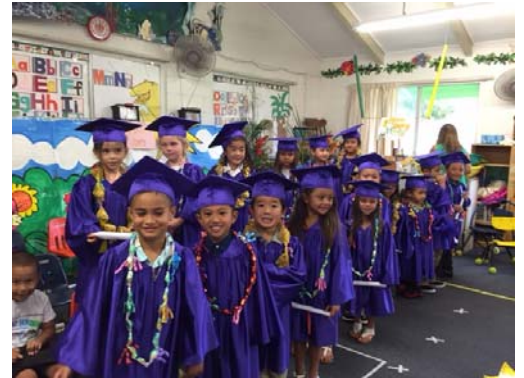
30th Graduating Class of Makawao Hongwanji Preschool.