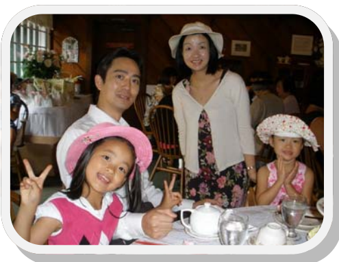
Umitani Family @ the Tea Party