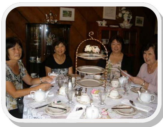
How Elegant, Ladies!