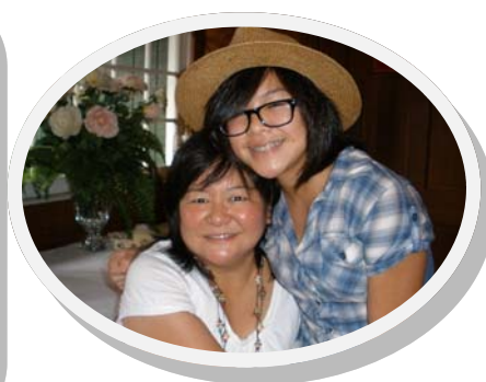
Mother, Daughter - What a Team!